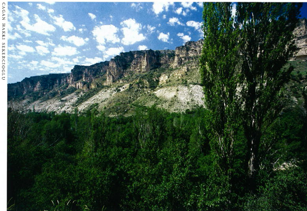
CAGAN HAKKI SEKERCIOGLU

T urkey has tremendous biological wealth that is often underappreciated. Three of the world's 37 plant zones mingle with various mountain ranges. Habitats range from Black Sea temperate rainforest, where brown bears and wolves roam and Caucasian Grouse and Caspian Snowcocks thrive in the shadow of the Caucasus Mountains, to subdesert scrub, where endangered desert monitors, striped hyenas, and sand gazelles share the southeastern plains with See-see Partridges and Cream-colored Coursers. Lying at the confluence of northern European forests, Mediterranean chaparral, and central Asian steppes, Turkey boasts more than 3,000 species of endemic plants, the highest among medium-sized temperate countries. Until the early 20th century, lions, cheetahs, leopards, and tigers were all found within the current borders of Turkey. The latter two may still survive, and there are