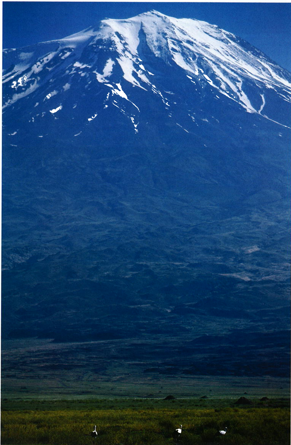
CAGAN HAKKI SEKERGICLI

Even though northeastern Turkey borders Georgia, the Caucasus Mountains block cold weather, and the climate is mild. Black Sea clouds dump more than two meters of rain yearly on the 3,937-meter-high Kackar Mountains, which are