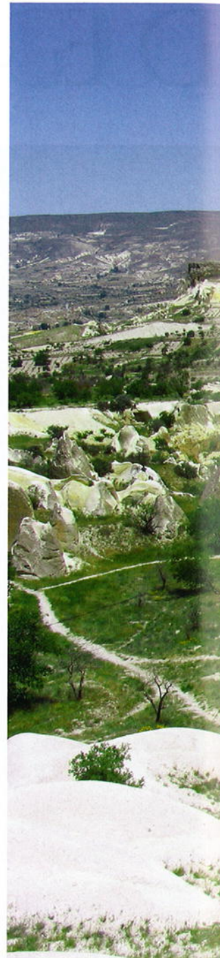
The open and mountainous terrain of Anatolia, interspersed with forests, provides a perfect habitat for Short-toed Eagles (left).

In the afternoon, seek shelter from the heat in the orchards, where Ménériés’s, Upcher’s, and Olivaceous warblers and Dead Sea, Spanish, and Yellow-throated petronia can be seen. As evening approaches, riparian areas may provide